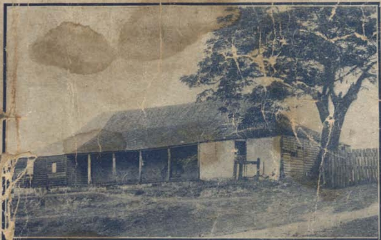
OLD GOVERNMENT HOUSE, WINDSOR.

Built between 1796-98. 8144 standing 1915.